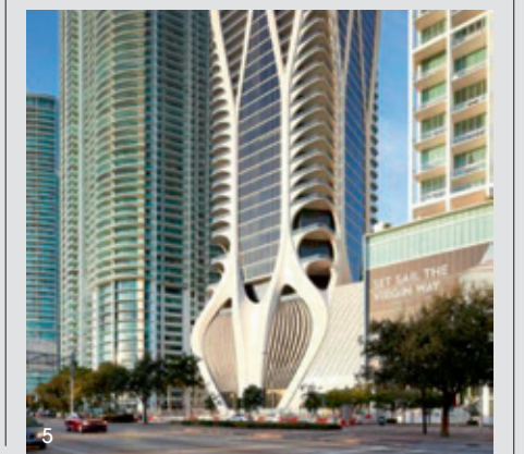
5. One Thousand Museum @ Hufon Crow 千禧博物館 © Hufon Crow