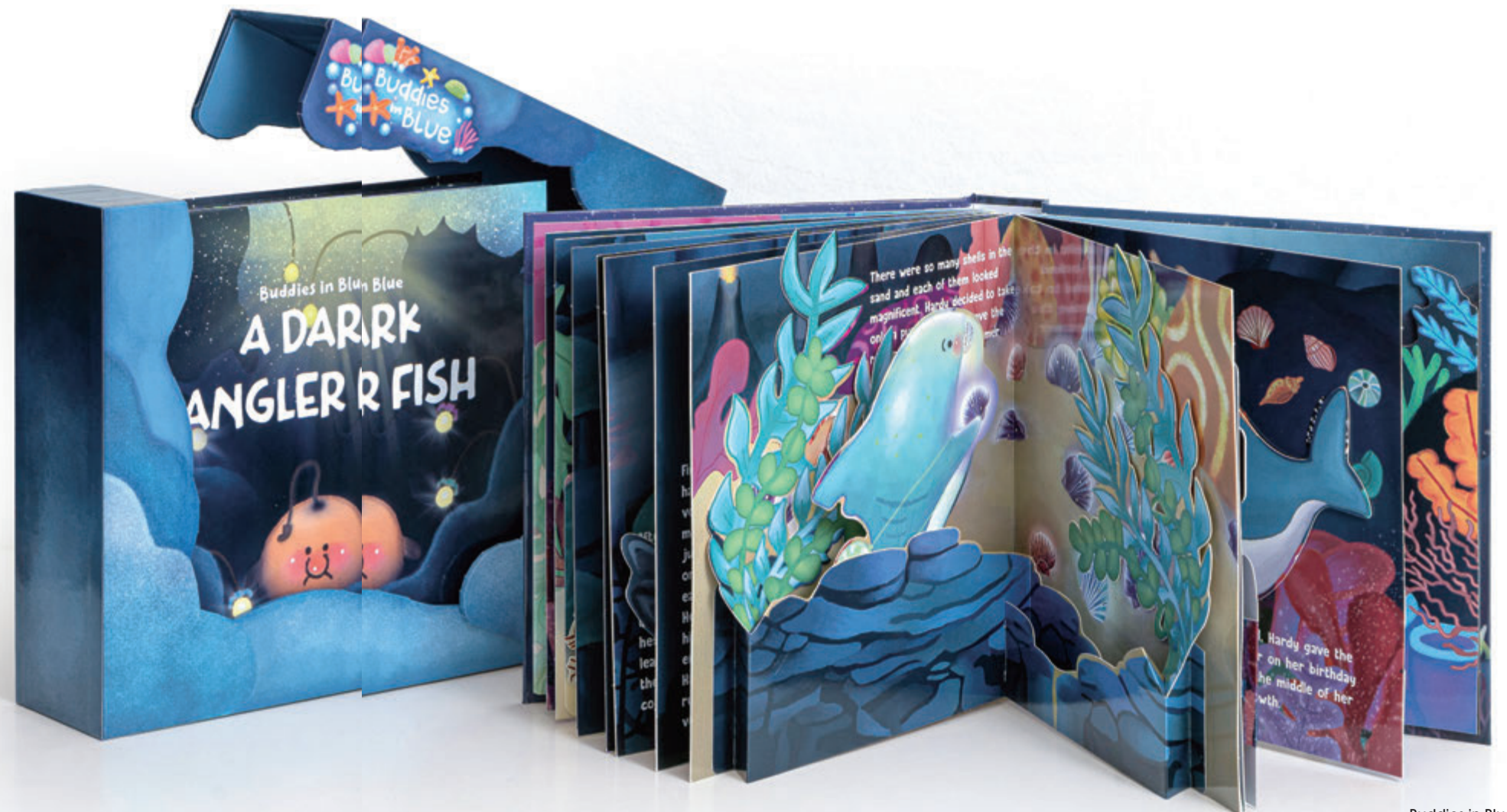
Buddies in Blue