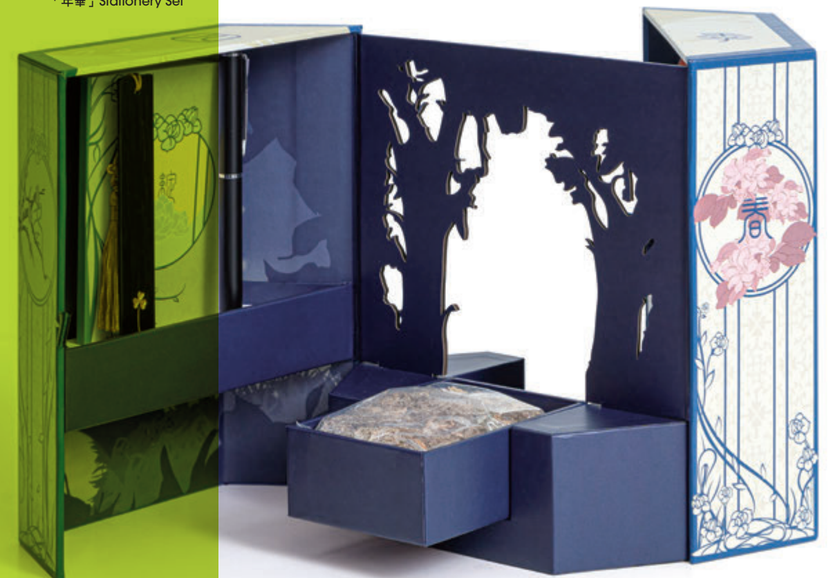
「年華」 Stationery Set

Another creation for IA China 2019, 年華 is a stationery set combining the ideology of “planting” and “time.” The exterior of the box comprises the four seasons, while the interior divides into “day” and “night.” At the centre of the set is the “planting” core. As soon as users open up the box with a “z” motion, the set will spiral open to reveal itself, leading users to find out the relationship between “planting” and “time.”