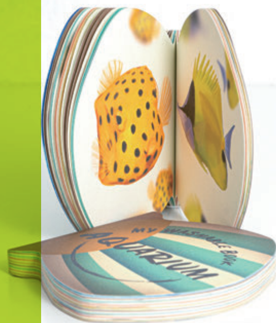
Washable Book – Aquarium