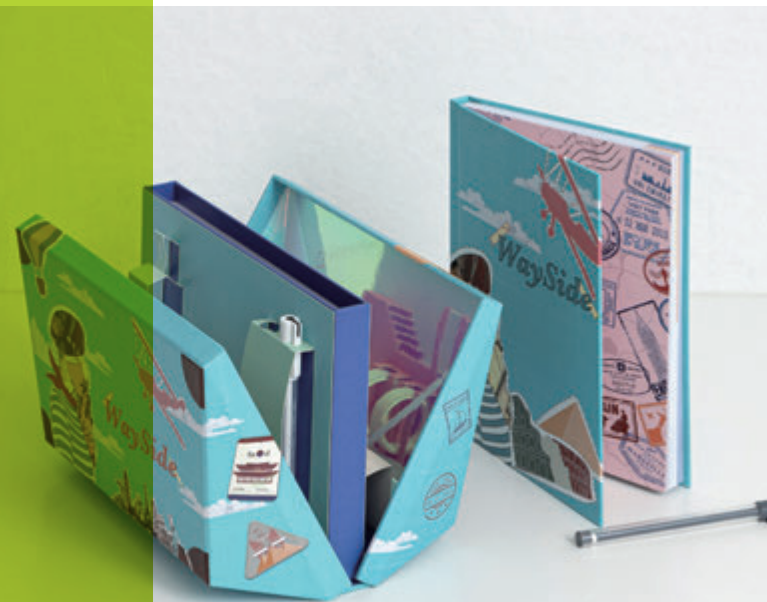
WaySide Stationery Set

artworks by HKDI graduates. These works were produced via digital printing technology on special paper and then bound into a book. Being waterproof is an understatement for this creation. Soak it in water, boil it on the stove, or store it in your freezer, and it will come out perfectly undamaged. Now imagine its potential applications, from children's books, swimming and diving accessories, to frozen food packaging. Washable Book is built to solve problems and meet a wide variety of needs.