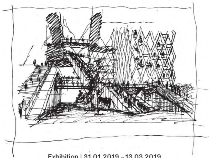
Exhibition | 31.01.2019 - 13.03.2019