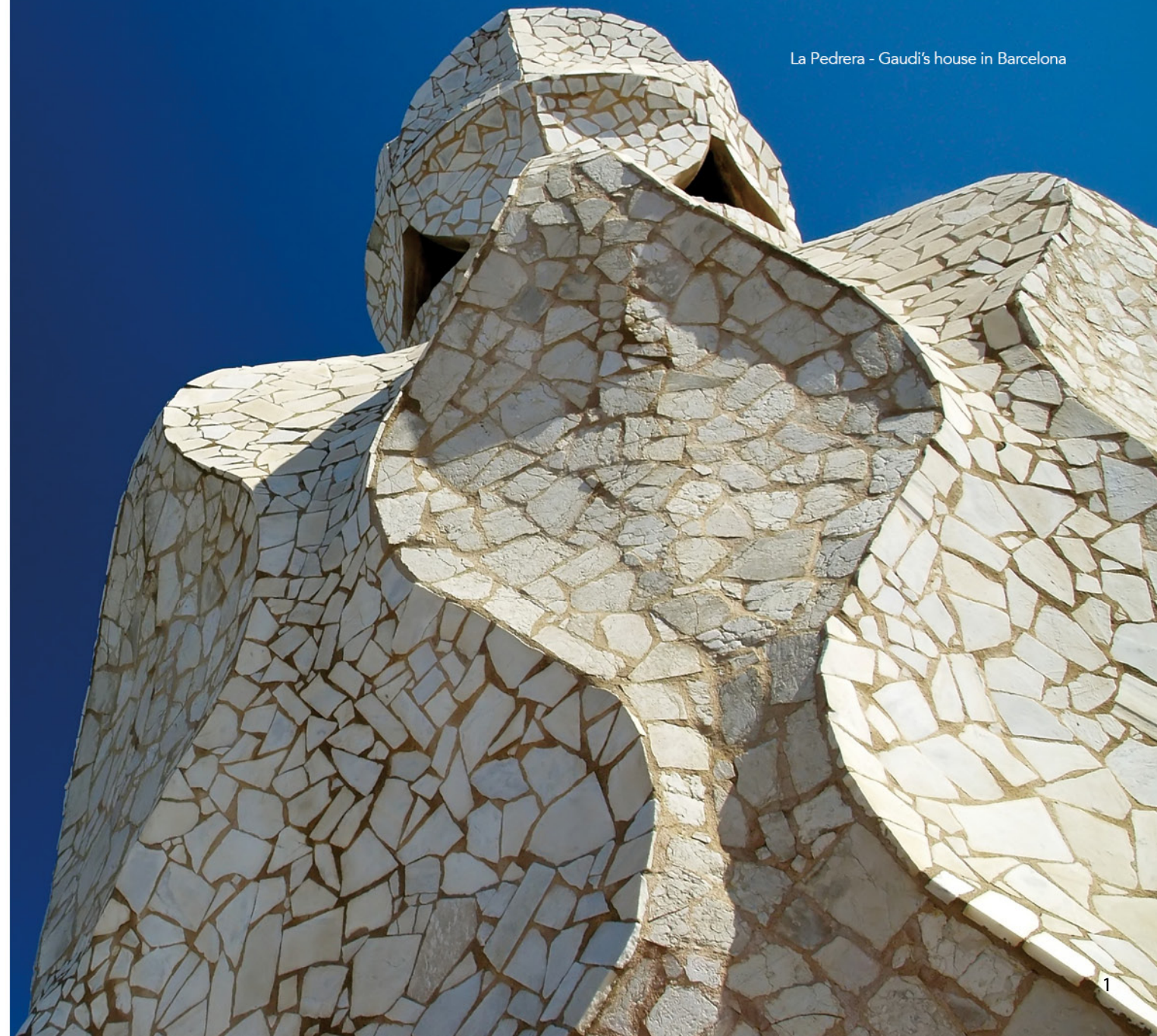
La Pedrera - Gaudi's house in Barcelona