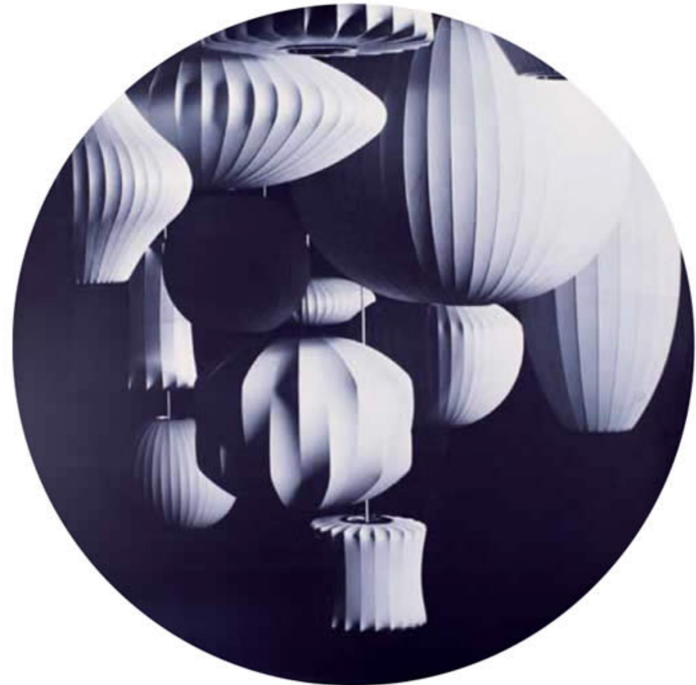
LEFT BUBBLE LAMPS CA. 1952

“We are very grateful to get this exhibition, the Asian tour of which is sponsored by Herman Miller. Last year we met some people from the Vitra Design Museum at the Asian