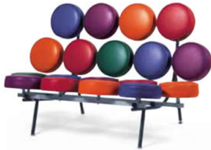
TOP: GEORGE NELSON, LATE 1940'S ABOVE: MARSHMALLOW SOFA, 1956

While his signature pieces such as furniture and lamps were always marketed under his own name, some