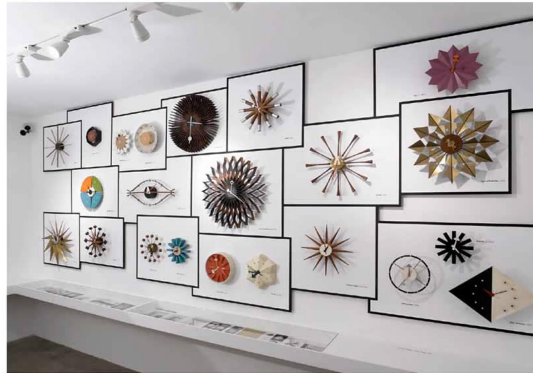
Vitra Design Museum

of his other designs just served their purpose without George Nelson even being mentioned in marketing, such as the packaging designs for the Abbott company created in the late 1950s. Usually designers do not work in both signature design and anonymous design, but Nelson did both."