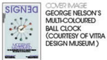
COVER IMAGE GEORGE NELSON'S MULTI-COLOURED BALL CLOCK

The Hong Kong Design Institute is a member institution of the Vocational Training Council. For more information about HKDI, please check our website on www.hkdi.edu.hk , or email us at hkdi@vtc.edu.hk