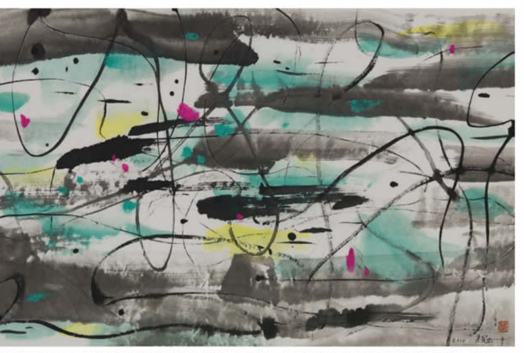
ABOVE AWAKENING (2010) INK AND COLOUR ON PAPER (《夢醒》,水墨設色紙本) EEOW WU GUANZHONG SPEAKING IN SUZHOU CITY, 18 JUNE 2008

and being forced to labour in a rural camp where he was forbidden to paint.