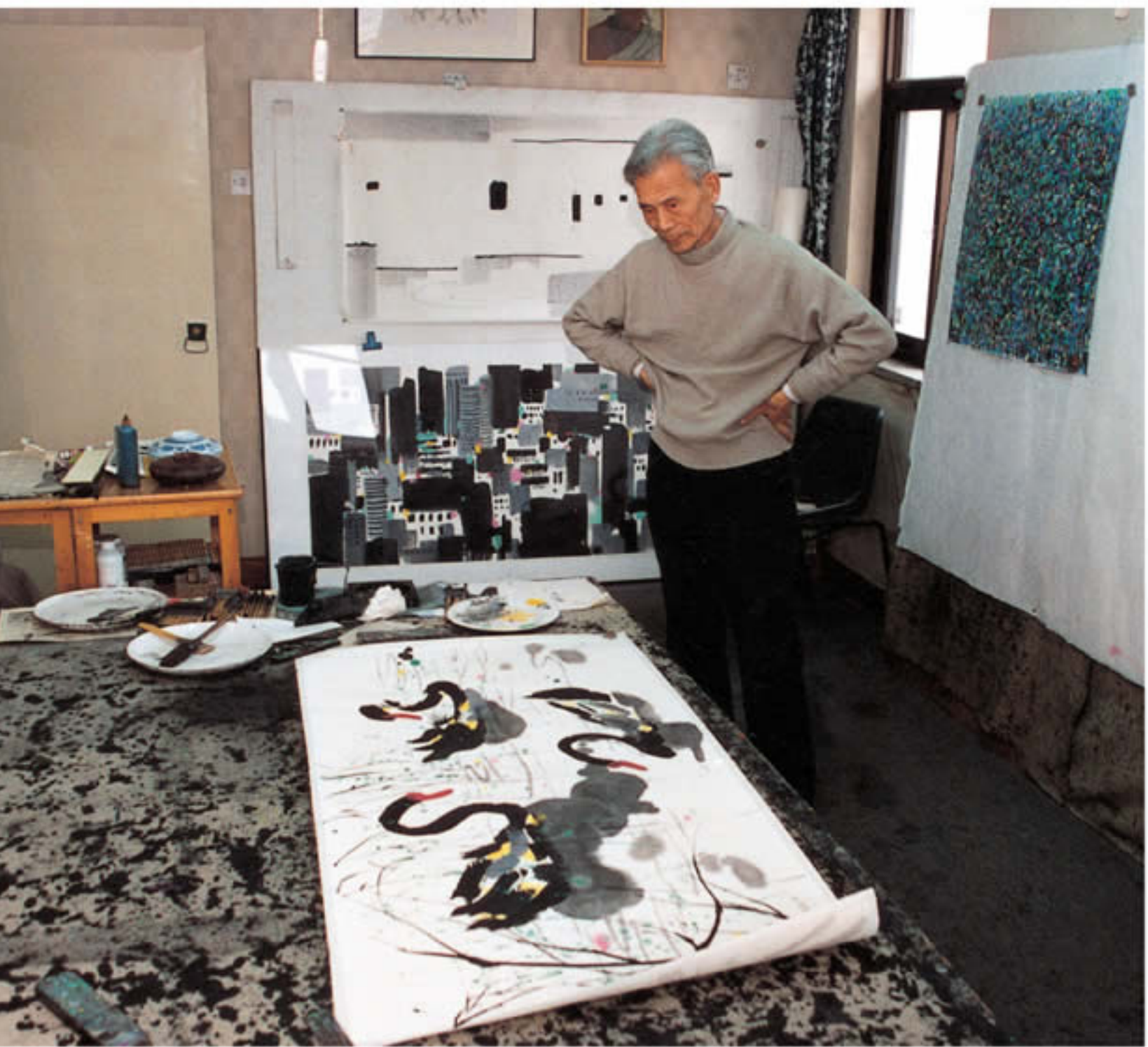
IFT A 7-FEET TALL CHINESE BRUSH AT THE WU GUANZHONG EXHIBITION AT HKDI HELD FROM JUNE 22 TO SEPTEMBER 14 ABOVE WU GUANZHONG AT HIS HOME IN FANGZHUANG, BEIJING, DECEMBER 1996